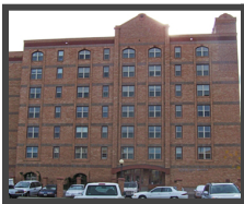
Richmond 62+ One-Bedroom

Follow us on Facebook at www.facebook.com/PuebloHousing/ or visit hapueblo.org for real-time updates on the number of application submissions received.