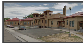
MOD Rehabilitation Three-Bedrooms