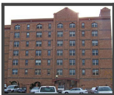
Richmond 62+ One-Bedroom

Follow us on Facebook at www.facebook.com/PuebloHousing/ for real-time updates on the number of application submissions received.